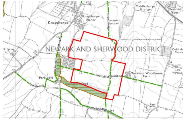
PRoW Map from the LVIA (Fig. 2)

Full consideration is given to impact on the setting and users of these Rights of Way (RoW) in the 'Landscape and Visual Impacts' section of this report. The County Council's RoW team reviewed the application and initially queried the offset provided between the development and PRoW network and the maintenance regime for the surfacing of the RoW in a seed mix as shown on the Landscape Master Plan. However, the amended Layout Plans has clarified that there would be an off set of 10m either side of the PRoW (a 20m corridor) and the Applicant has clarified that the grassed areas proposed would be maintained by a management company as part of the wider management of the operational scheme – the future management and maintenance of the Site can also be controlled by a suitably worded condition. The RoW Team have raised no objection to the application on this basis. Overall, it is therefore not considered that the physical routes of existing PRoW would be adversely affected by the proposed development.