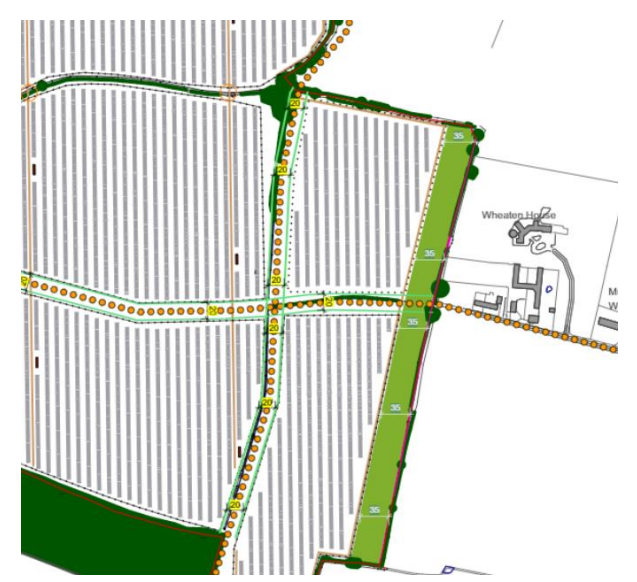
Proposed Site Layout Plan showing green buffer off-set from properties to the east

negotiations an amended plan has been submitted showing a 35m off-set from the eastern boundary (see plan below) with additional structural buffer planting (maintained at 3m in height) and semi-mature trees planted at 4.5-5m in height. Influence have concluded that this would assist in reducing the scale of effect on the closest properties but would not prevent the overall major-adverse impact recorded on these properties for the duration of the scheme.